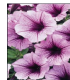
Plum (item #11)

We also offer Mixed Color Petunia Baskets Many Striking Combos Growers Choice (item #12)