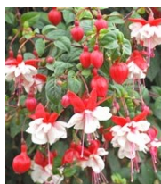
Swing Time (item #17)

Gorgeous fully double hanging flowers that bloom all summer. Bright-diffused light out of direct sunlight.