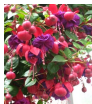
Dark Eyes (item #16)