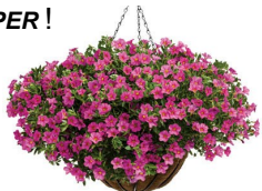
Pink (item #6)

Mixed Color Calibrachoa Baskets Many Striking Combos Growers Choice (item #7)