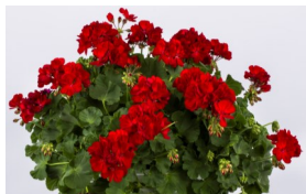
Red (item #13)